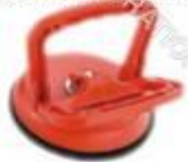
GLASS SUCTION PLATE