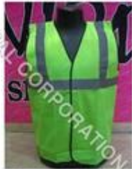
reflective jacket heavy fabric with grey reflective tape