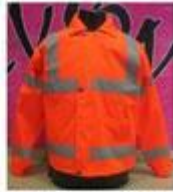
Woolen reflecting jacket with grey reflective tape