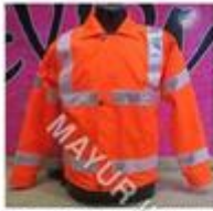
Woolen reflecting jacket with reflective tape