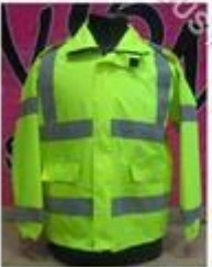
Wind abiter with grey reflective tape